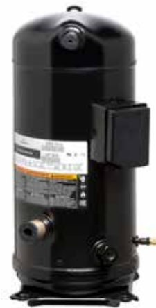
ZH*KCE scroll compressor for heat recovery

The range of products goes from the ZH40KCE (7.5hp) to the ZH150 (30hp) which can be tandemized.